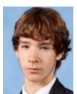
Top pupils for Sparx reader are: